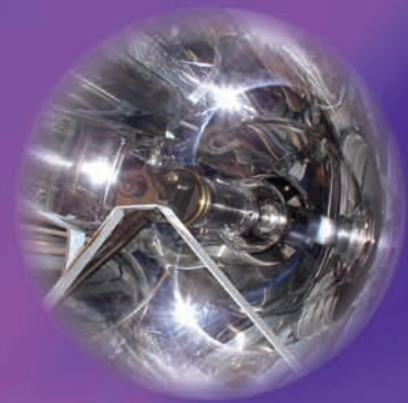
Liquid-Cooled Lamp in IMAX Projection System

Coolant: Deionized or distilled water with a maintained specific conductance of 50 micromhos per cm. maximum. Outdoor searchlight lamp - a mixture of ethylene glycol and deionized or distilled water may be used. Filter: 10 microns at anode inlet for deionized or distilled water. 25 microns for ethylene glycol and deionized or distilled water mixture.