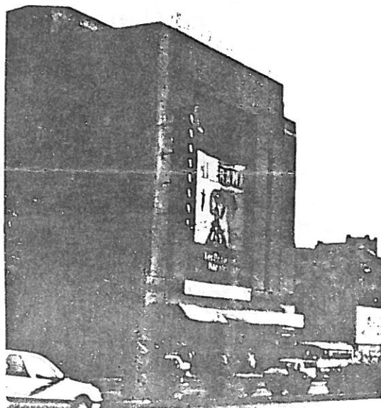
Still Going Strong. Santiago Cinerama. Chile. 1961.