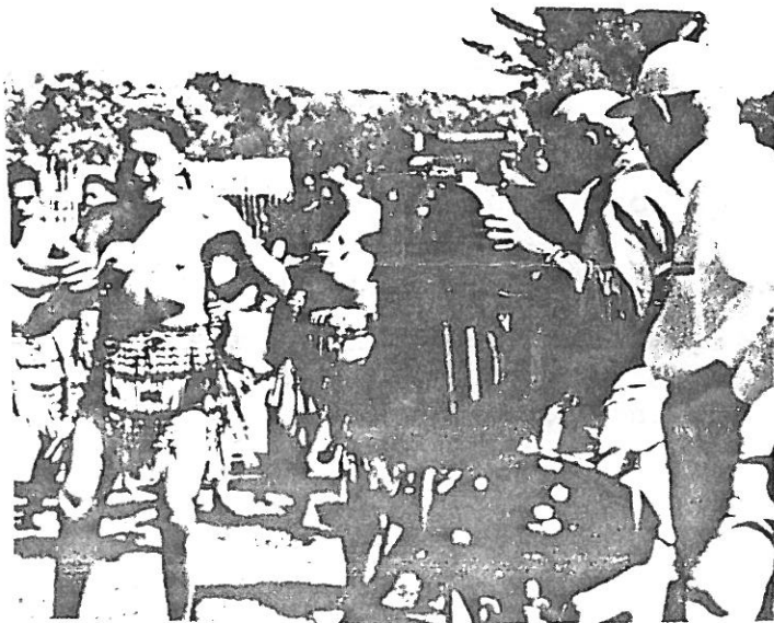
Filming SOUTH SEAS ADVENTURE . Rottmas, NZ.

HELP CORNER. The playdates for the Music Hall Cinerama in Detroit list EL CID as being presented from December 21st 1961 to May 24 th 1962, at a period when the theatre was not equipped for 70mm. Was this a specially prepared 3-strip version? Can anyone help with this mystery? The 70mm equipment at Detroit did not go in until March 1963 and even then they kept and used 3-strip occasionally until December 1965.