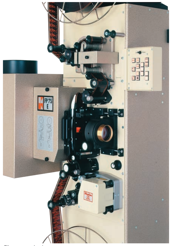
Film run mechanism