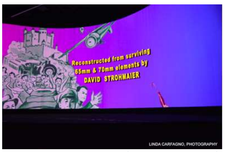
Widescreen Weekend Film Festival, Bradford 2015